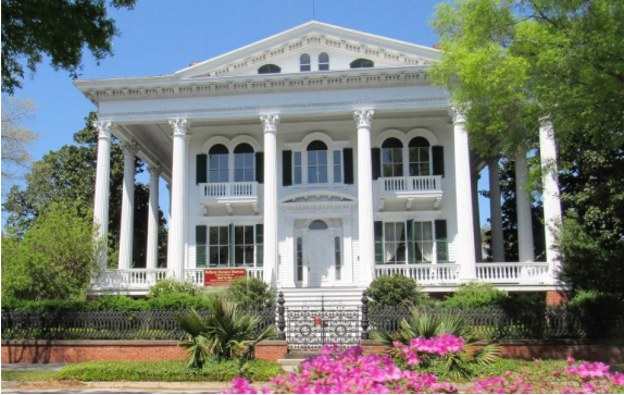
Wilmington's historic Bellamy Mansion

The Convention webpage is http://www.ncdkg.org/2017-convention.html