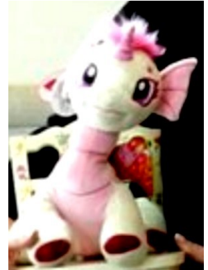
WILMA, the dragon, will be a special guest at the LDS.